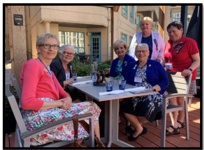
Lunch at the National Convention Hotel