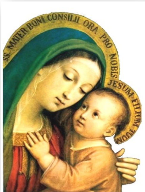
Our Lady of Good Counsel Remains Our Patroness

Blessings to you in your work for God and Canada. Thank you.