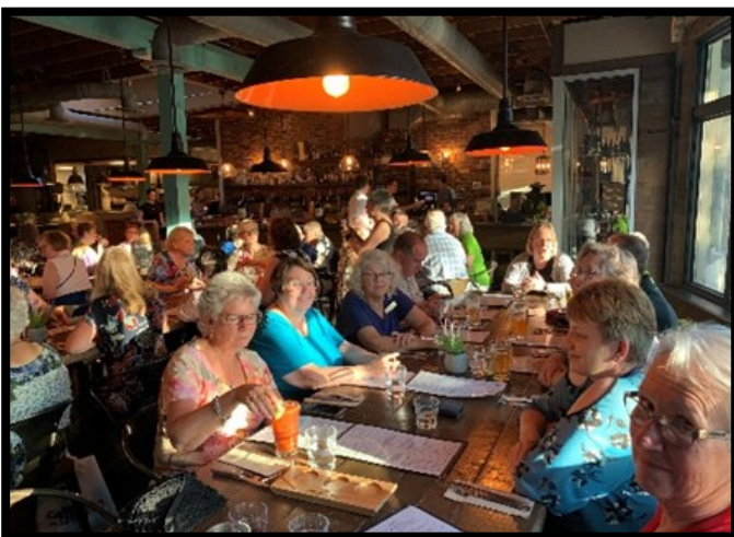
Alberta Mackenzie Provincial Dinner at Convention